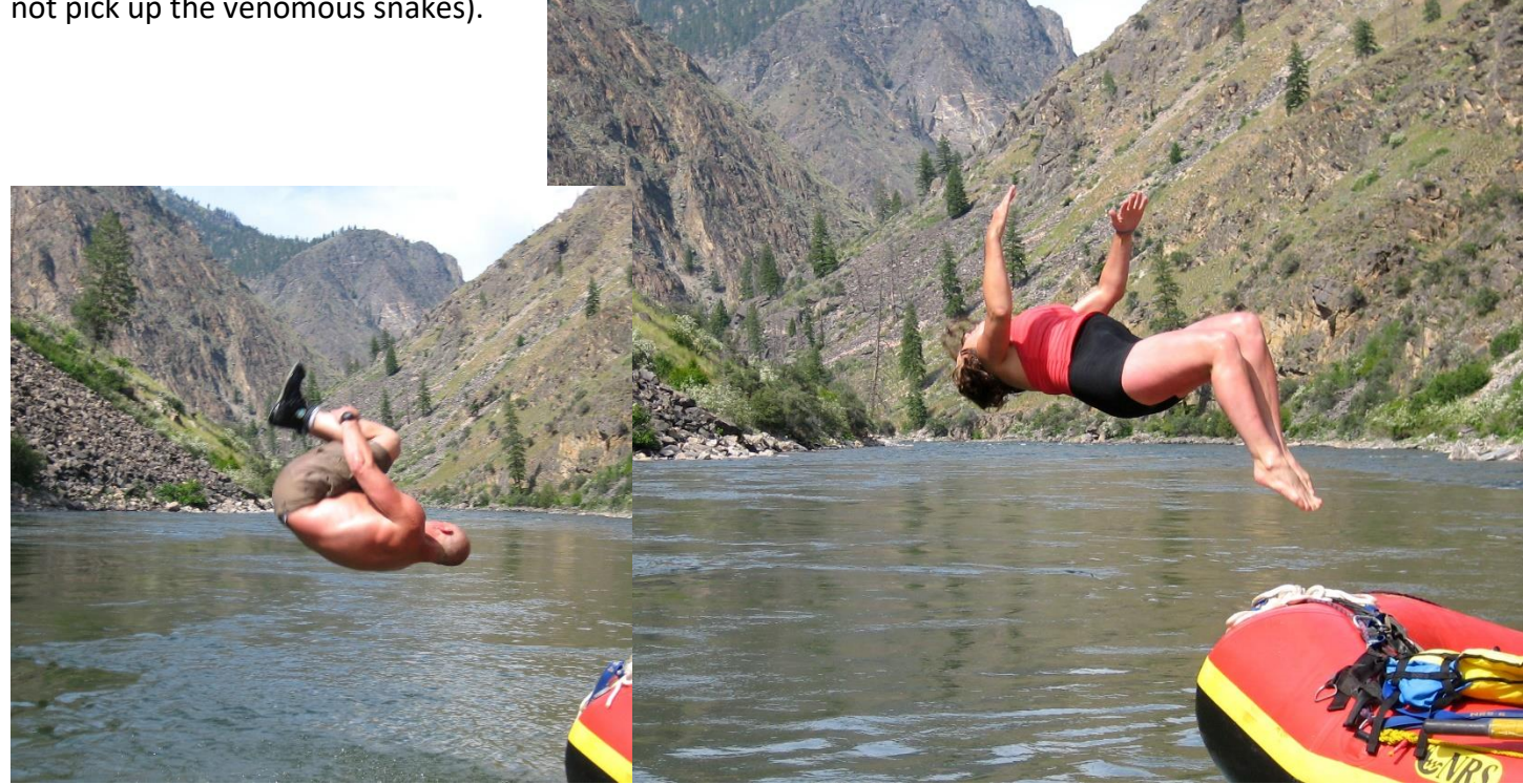
Page 8 of 9

find the friendly reptiles (she does not pick up the venomous snakes).