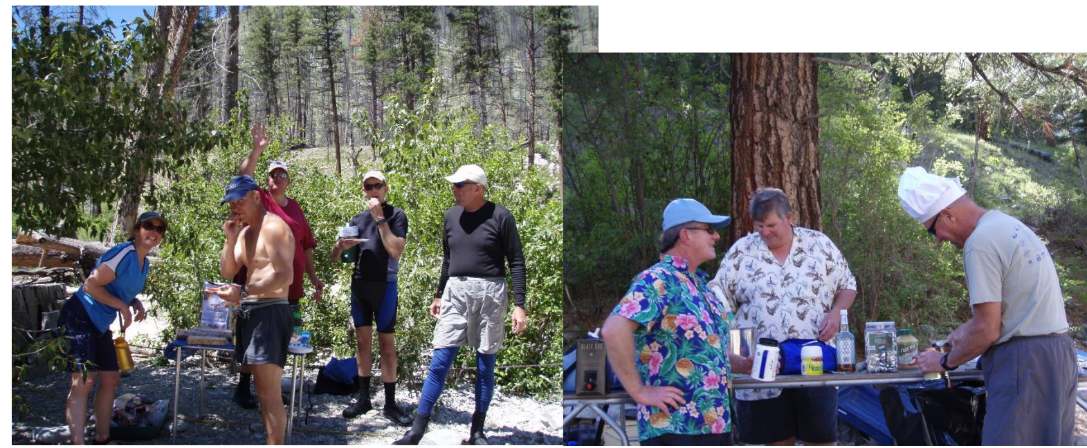
Page 5 of 9

We all run fine through Lake Creek rapid and slide through Pistol Creek rapid (no logs here) to enjoy our sunny lunch spot below. We enjoy a rib feast tonight at our Marble Creek camp.